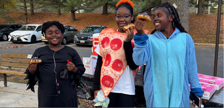
Happy Halloween @ Waterford Place