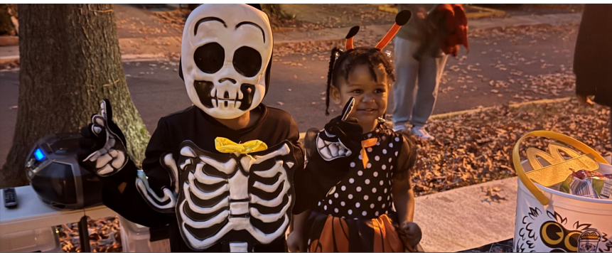
Happy Halloween @ Waterford Place