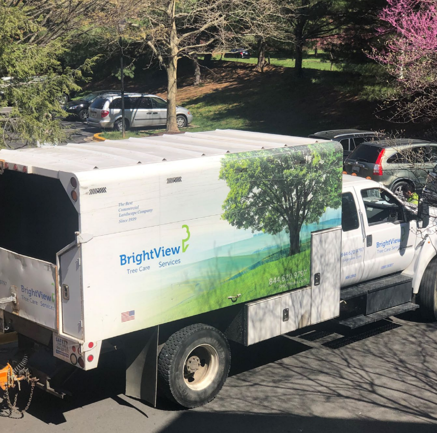
BrightView Tree Care Services