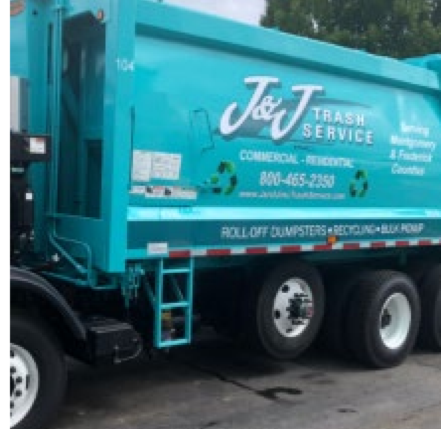
J&J Trash Service