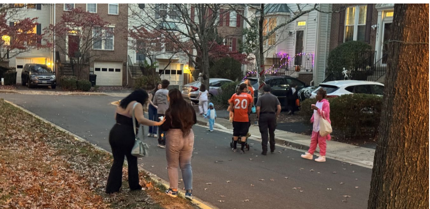
Happy Halloween @ Waterford Place