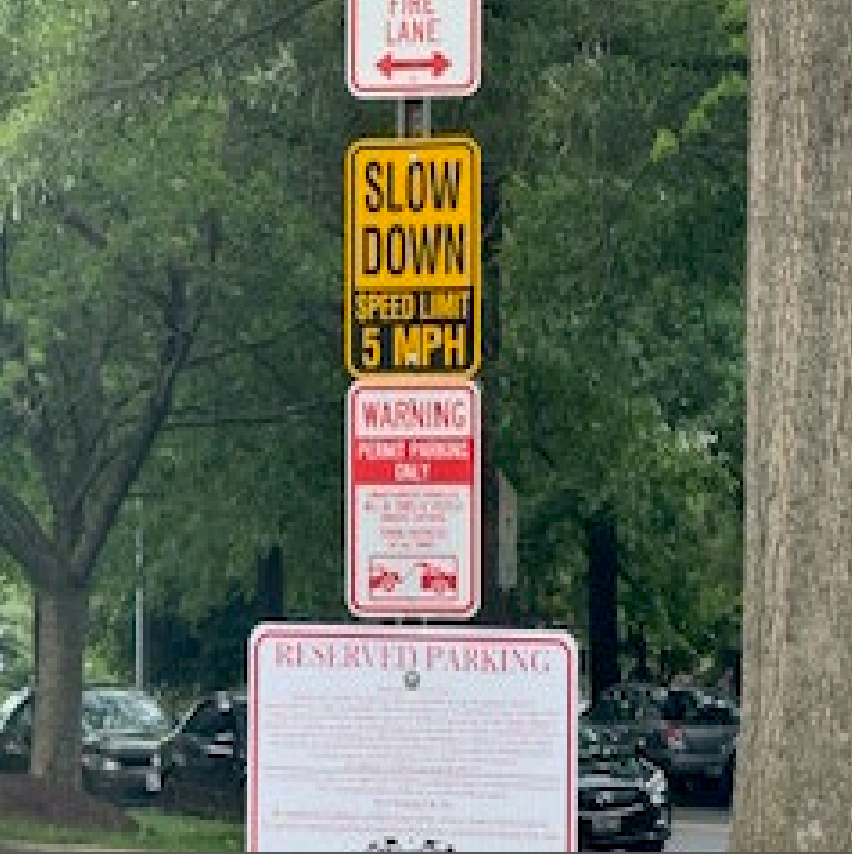
Reserved Parking (Residents/Visitors)