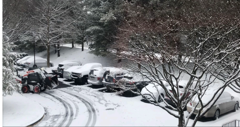
Howell Brothers Snow & Ice Removal