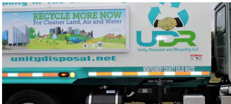
Unity Disposal & Recycling