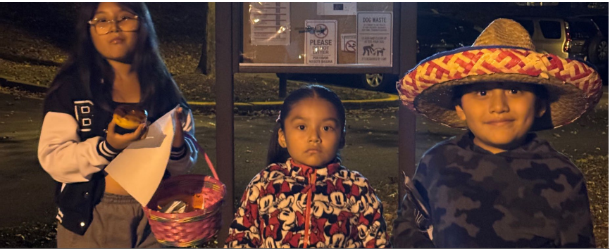
Happy Halloween @ Waterford Place