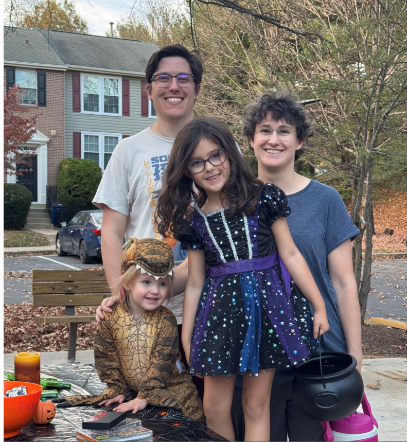
Happy Halloween @ Waterford Place