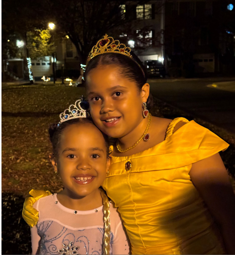
Happy Halloween @ Waterford Place