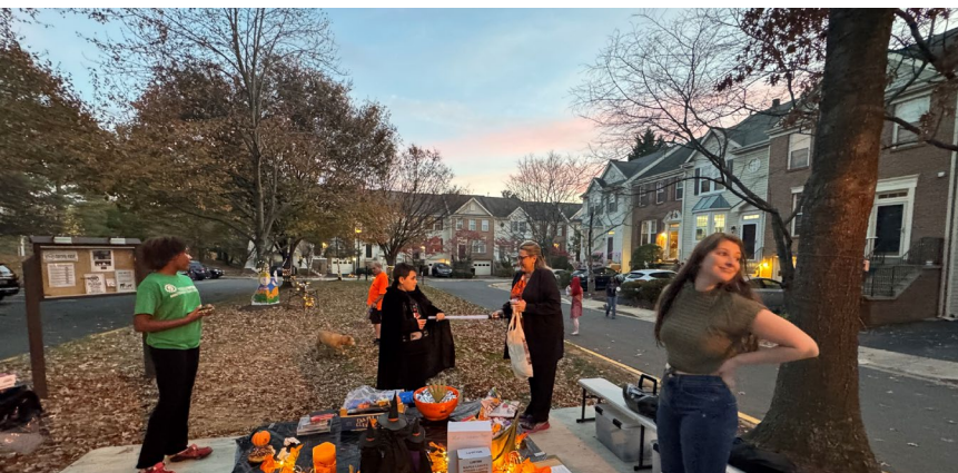
Happy Halloween @ Waterford Place