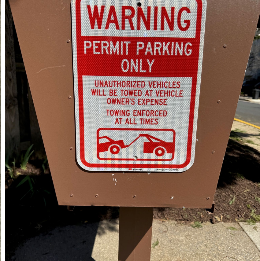
Permit Parking Only Signage