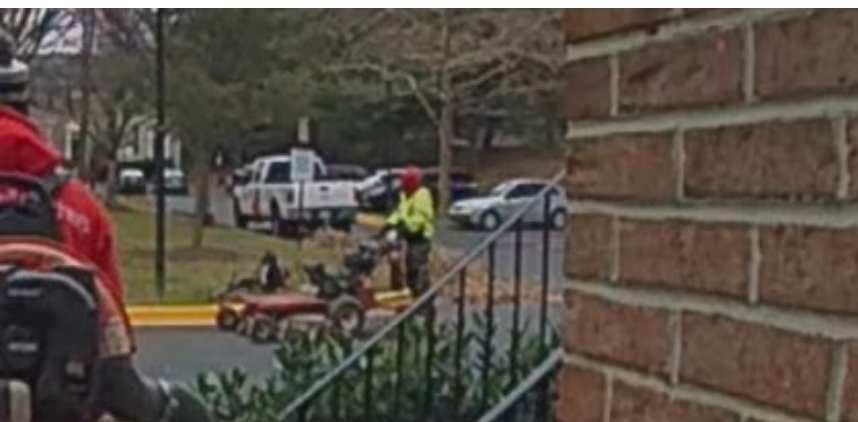
Howell Brothers Lawn & Landscaping

Providers of Grounds Maintenance, Tree Care, Trash Service & Recycling Service