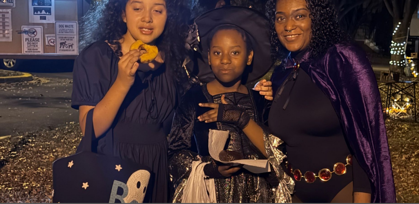
Happy Halloween @ Waterford Place