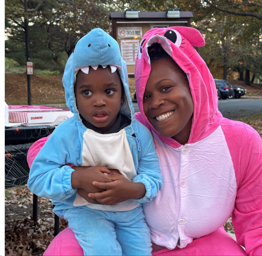
Happy Halloween @ Waterford Place