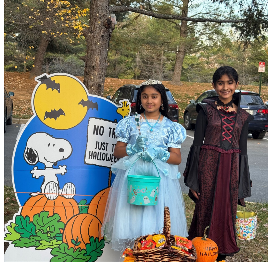
Happy Halloween @ Waterford Place