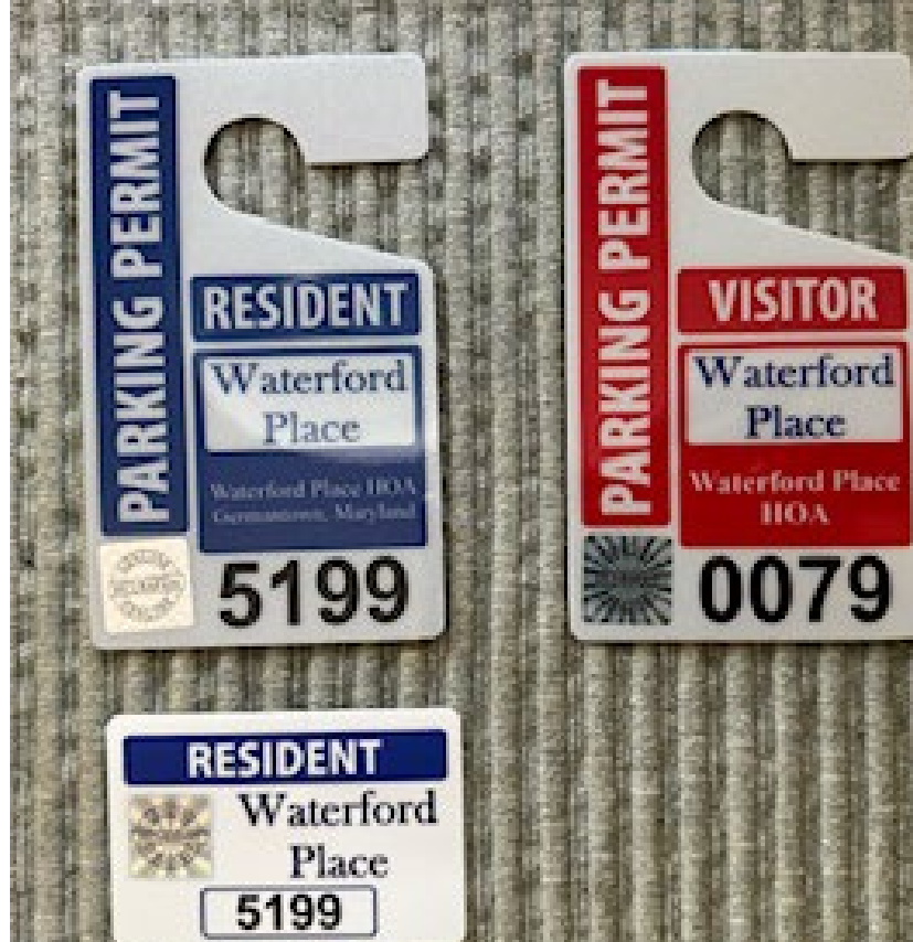
Parking Permits (Residents/Visitors)